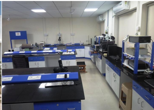
18. Visit to Centre for Advanced Sensor Technology, Dr. BAMU, Aurangabad