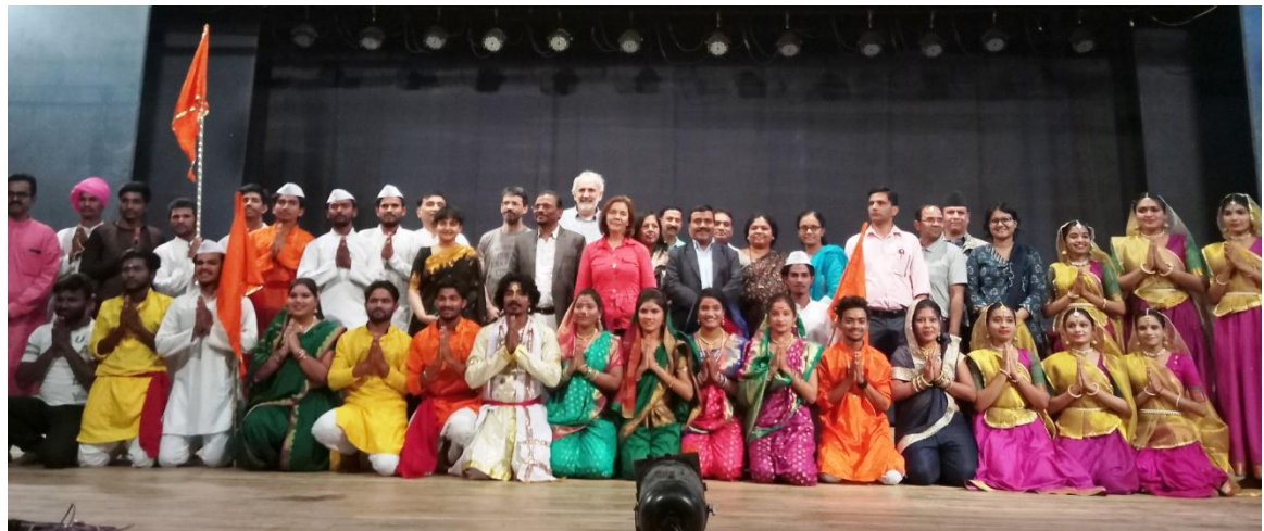
11. Cultural Programme by students at Dr. B.A.M. University, Aurangabad