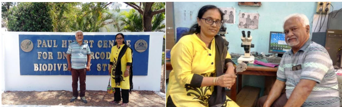
24. Visit to the Paul Herbert Center for DNA Barcoding & Biodiversity Studies, BAMU