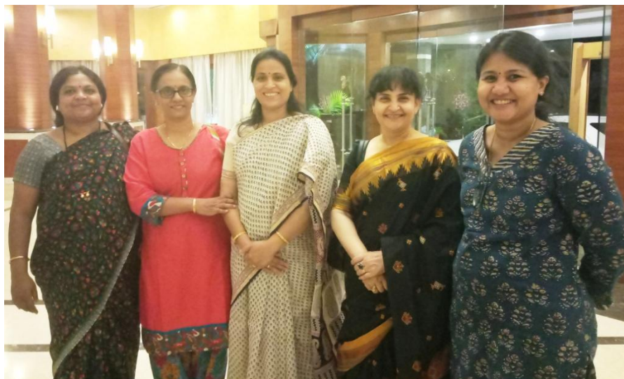
12. Anna University delegates at Dinner hosted by Dr, B.A.M. University, Aurangabad