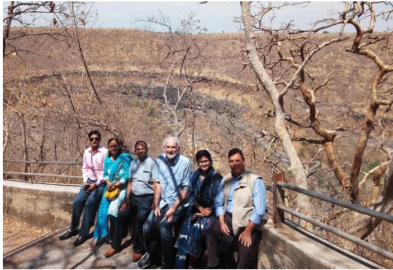
9. Group photo with the Ajanta Caves as backdrop 10. Group Photo at the Ajanta Caves