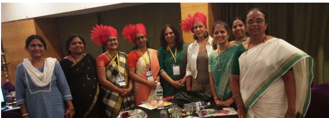
8. Anna University Delegates with the Project Coordinator and Organizing Committee