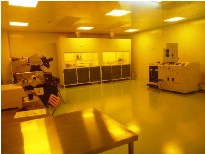
22. Class 10000 room for high precision measurements