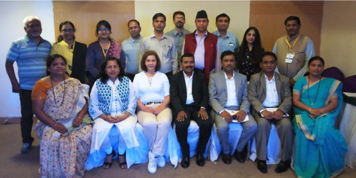
12. Group Photo of Delegation after Round Table Discussion and Closing Remarks