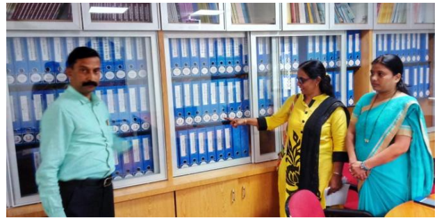
16. Visit to the IQAC Office, Dr. BAMU, Aurangabad