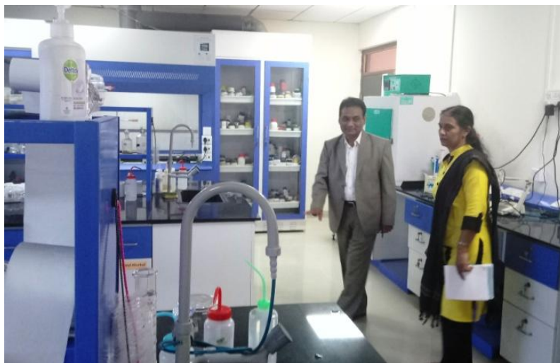
23. Advanced Chemistry lab